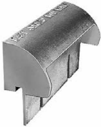
Type T2 Back

6" Curb radius Height adjusts 5 1/2" to 8"