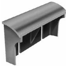
Type T4 Back

6" Curb radius Height adjusts 5 1/2" to 8"